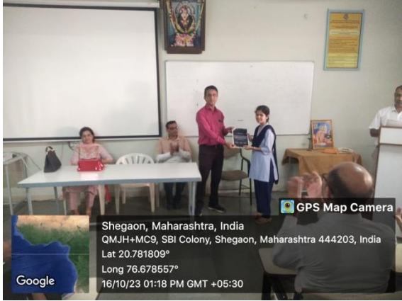
Certificate Distribution by Digitech Systems