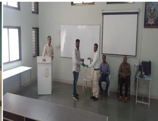
Certificate Distribution- SIP