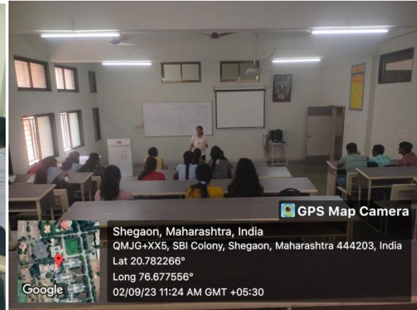
Glimpses of BARSА Activities-Presentation