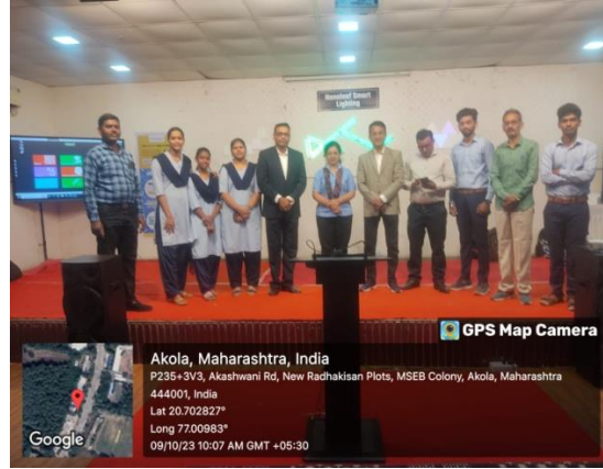
Digitech Systems Expo, Akola