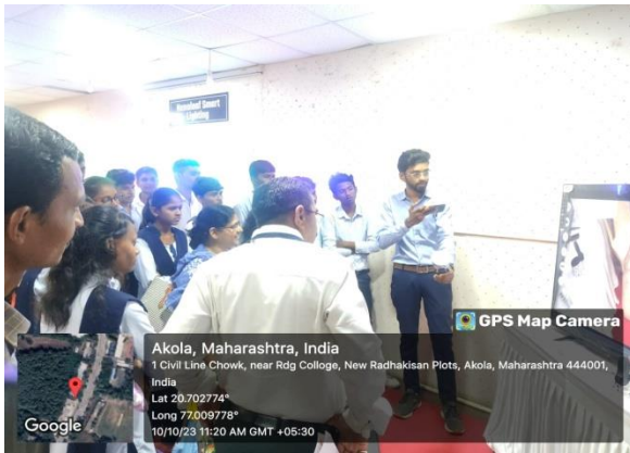
Digitech Systems Expo, Akola