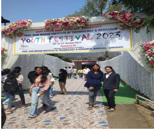
Youth Festival, Amravati