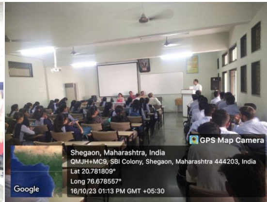
Certificate Distribution by Digitech Systems