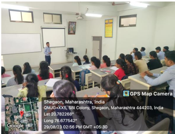
Glimpses of BARSА Activities- Extempore